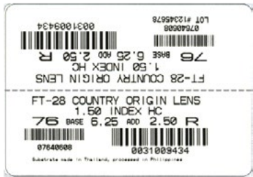
"Substrate made in processed in" example