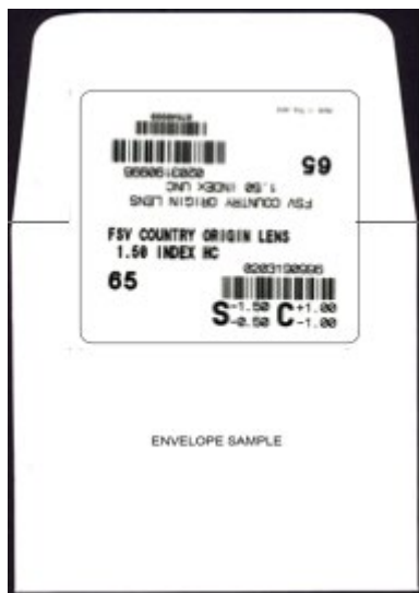
"Made In" example