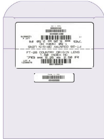
"Made In" example