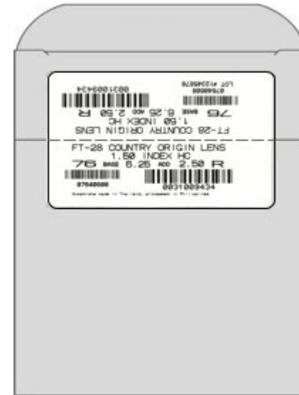
"Substrate made in processed in" example