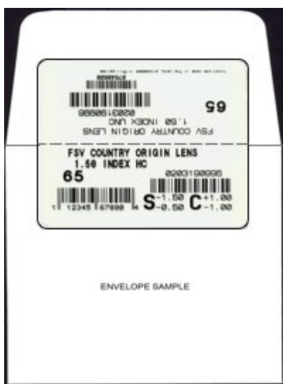
"Substrate made in processed in" example