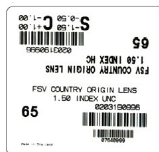
“Made In” example