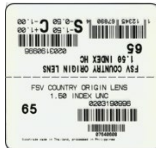
“Substrate made in processed in” example